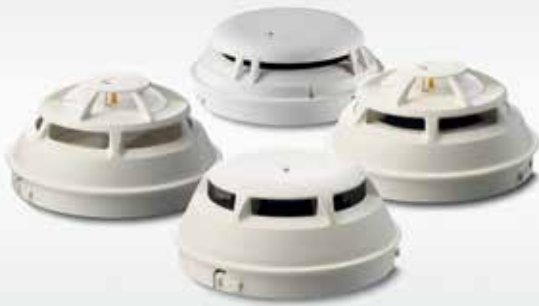
Data centers, telecommunications facilities, office buildings, or industrial production facilities – Cerberus PRO offers a detector for any application.

A comprehensive offering of standard detectors and advanced detectors with ASAtechnology ™ offer versatility to protect clean, dirty, or normal environments.