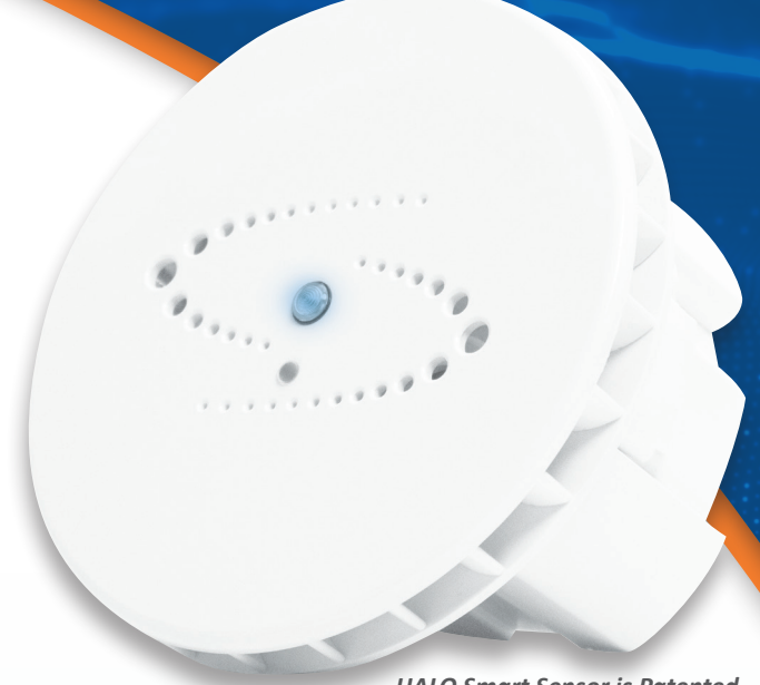
HALO Smart Sensor is Patented.

Catch chemical spills and hazardous gases in science labs, mechanical and utility rooms, custodial closets, and maintenance areas.